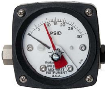
Model 120 0-30 PSID With Maximum Follower Pointer