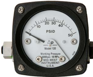
Model 120 0-50 PSID 2-1/2" Dial

A low cost differential pressure gauge for use in measuring the pressure drop across filters, strainers, separators, valves, pumps, chillers, etc., and for local flow indication and control.