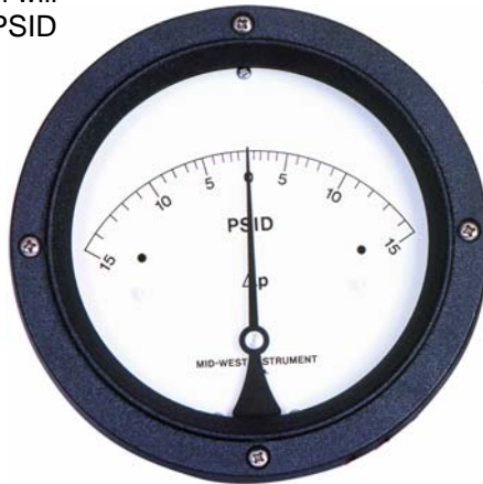
Model 120 15-0-15 PSID 4-1/2" Dial Bi-Directional