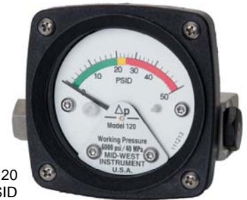
Model 120 0-50 PSID With Special 3 Color Dial

An optional maximum indication follower pointer provides automatic indication of maximum differential occurring during a time period or system cycle. Reversed pressure ports are optionally available to facilitate installation and readability depending on which side of a filter, etc., the instrument must be installed.